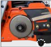
■ Rotating plastic chain catcher ■ Inboard clutch