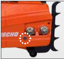
■ Side access chain tensioner