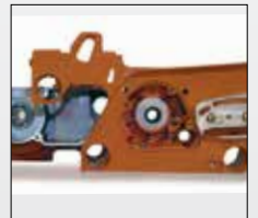
■ Magnesium die-cast crankcase